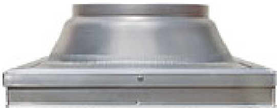
CURB MOUNT FLASHING