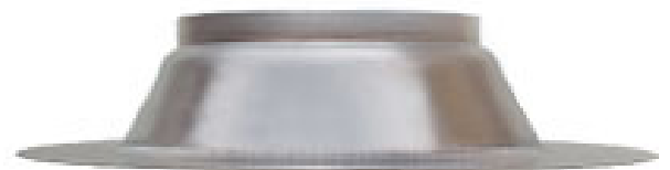
FLAT ROOF FLASHING